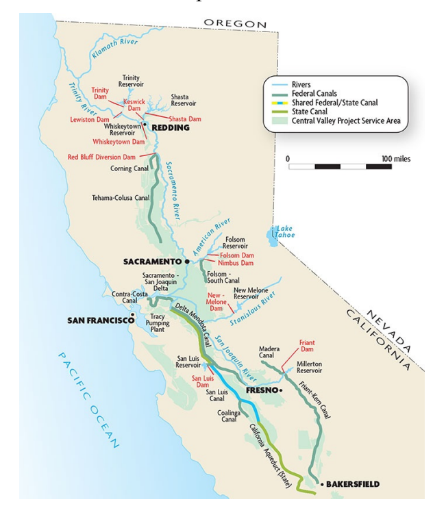
Fig. B. CVP and SWP Map.<sup>5</sup>

<sup>5</sup> Central Valley Project, U.S. Bureau of Reclamation, http://www.usbr.gov/projects/Project.jsp?proj_Name=Central+Valley+ Project (last visited Oct. 21, 2014 8:55 a.m.); James Nickles et al., California's BAY-DELTA: USGS Science Supports Decision Making, http://pubs.usgs.gov/fs/2010/3032/ (last visited Oct. 21, 2014, 9:00 a.m.).