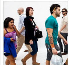
On the Clothes Watch at SXSW