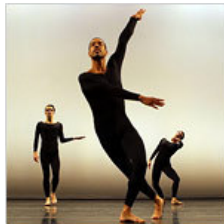
A Golden Age Continues Without Its Midas